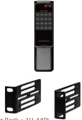
Ear Rack : 1U-440L