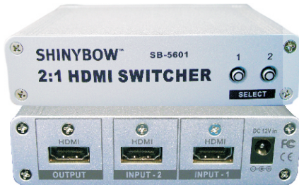
SB-5601 HDMI SWITCHER 2x1

Inputs : 2x HDMI (Digital Video-TMDS, Digital Audio) with HDCP Outputs : 1x HDMI (Digital Video-TMDS, Digital Audio) with HDCP