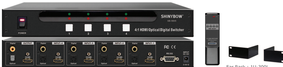
Ear Rack : 1U-300L