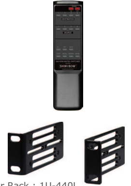
Ear Rack : 1U-440L