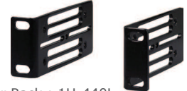
Ear Rack : 1U-440L