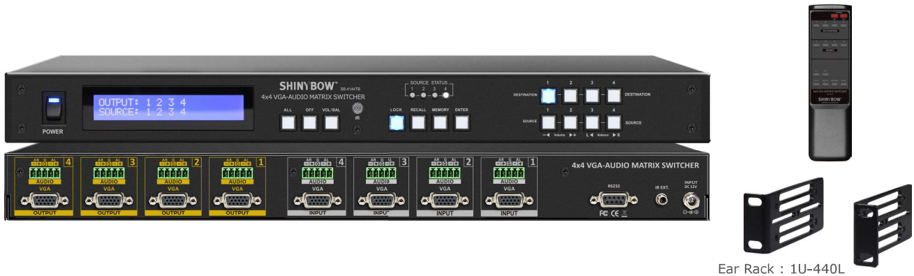
Ear Rack : 1U-440L

VGA AUDIO MATRIX RS-232 PRO Terminal Block BALANCE VOLUME