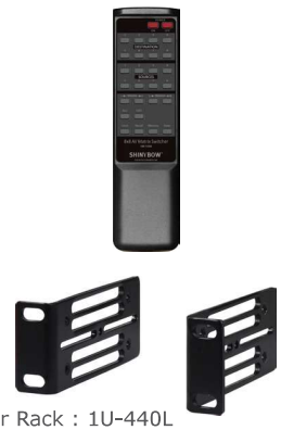
Ear Rack : 1U-440L