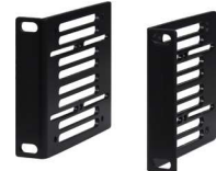
Ear Rack : 2U-440L