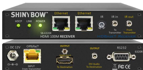
SB-6320R HDMI HDBaseT Receiver with Audio

Input : 1x HDBaseT Output : 1x HDMI, 1x DVI-D Audio Controls : RS-232, IR (in/out), 2x LAN