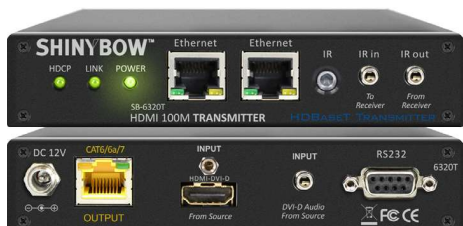
SB-6320T HDMI HDBaseT Transmitter with Audio

Input : 1x HDMI, 1x DVI-D Audio Output : 1x HDBaseT Controls : RS-232, IR (in/out), 2x LAN